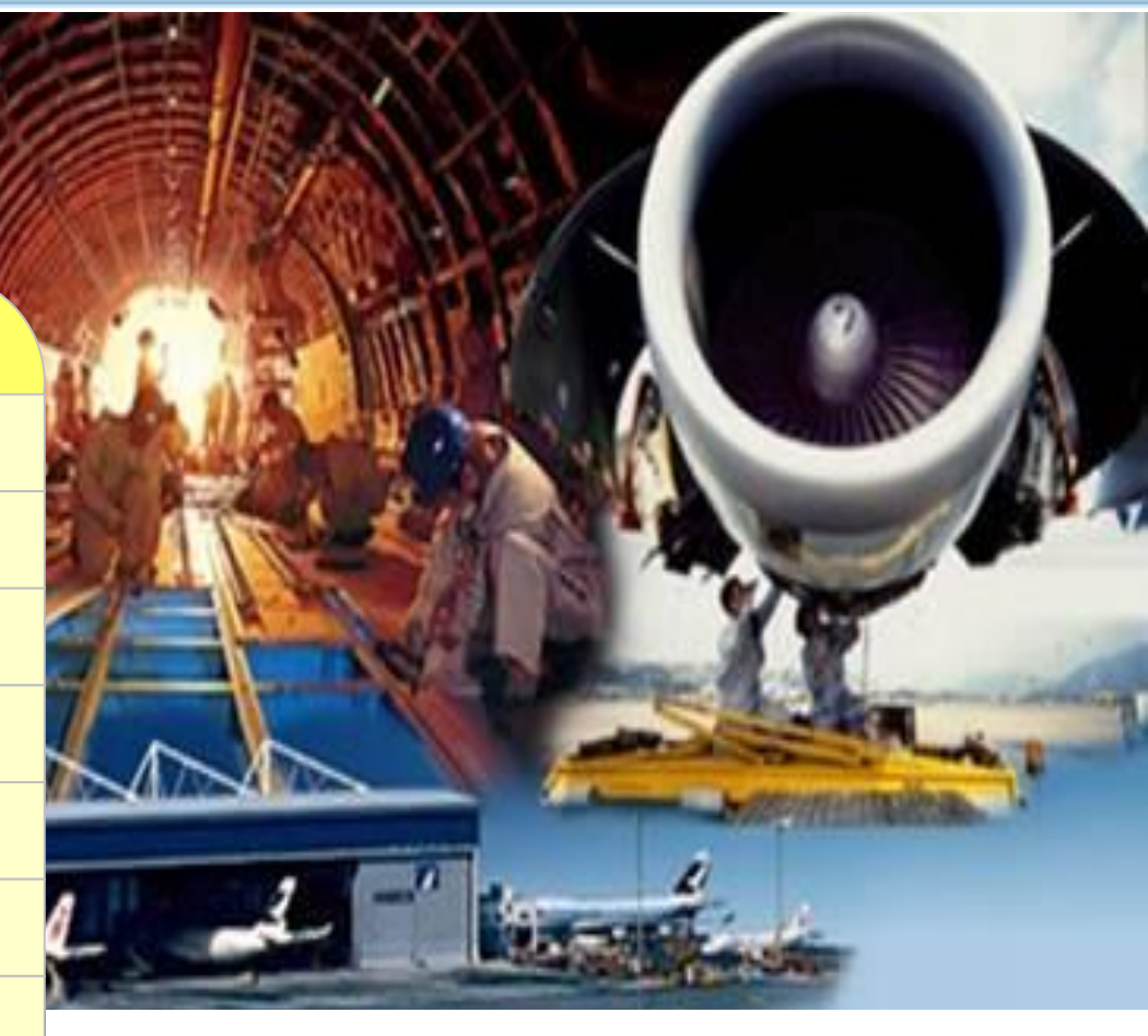
Bottom line: A registered IOSA operator will have ICAO core SMS elements in place